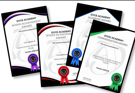
Celebrating Success Page 5