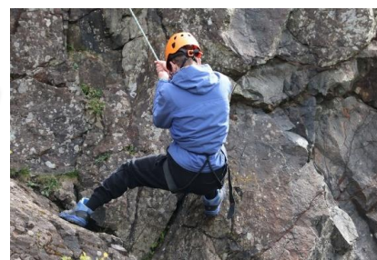
Activities Week Page 8 and 9