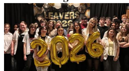
Goodbye to the Class of 2026 Page 15