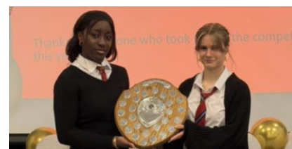
Inter-House Competition Page 14