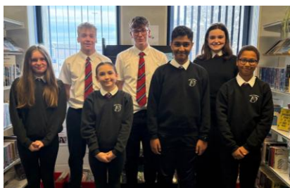
Uniform Reminders Page 4