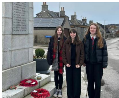
Remembrance Day Page 3