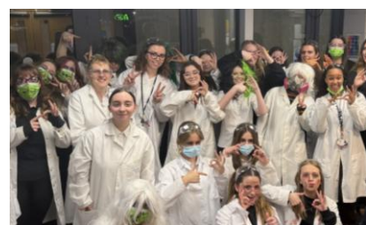
Fright Night Page 5