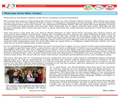
Welcome from Miss Arthur Page 2