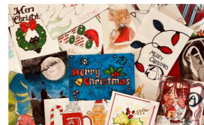
Christmas Card Competition Page 8