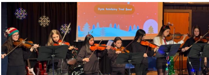
Expressive Arts Faculty