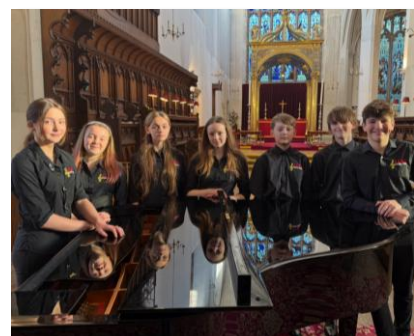
ACMS Updates Page 4