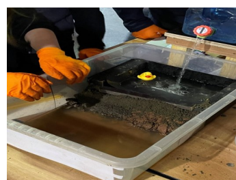
Dam Building and testing: