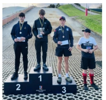
on the day and 1<sup>st</sup> in his age group. Huge congratulations!