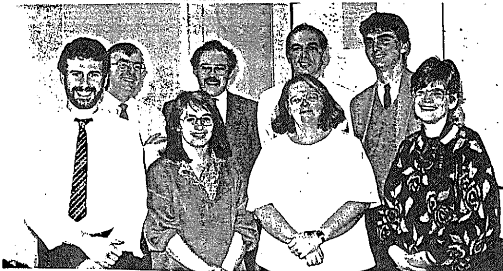
THE EDITORIAL TEAM

Hence this monthly newspaper. Our aim is to give everyone who lives or works in the Dyce, Newmachar and Fintray area an opportunity to find out about the school's achievements, activities and plans. We find the school an interesting place to work in; we think you will find it interesting to read about.