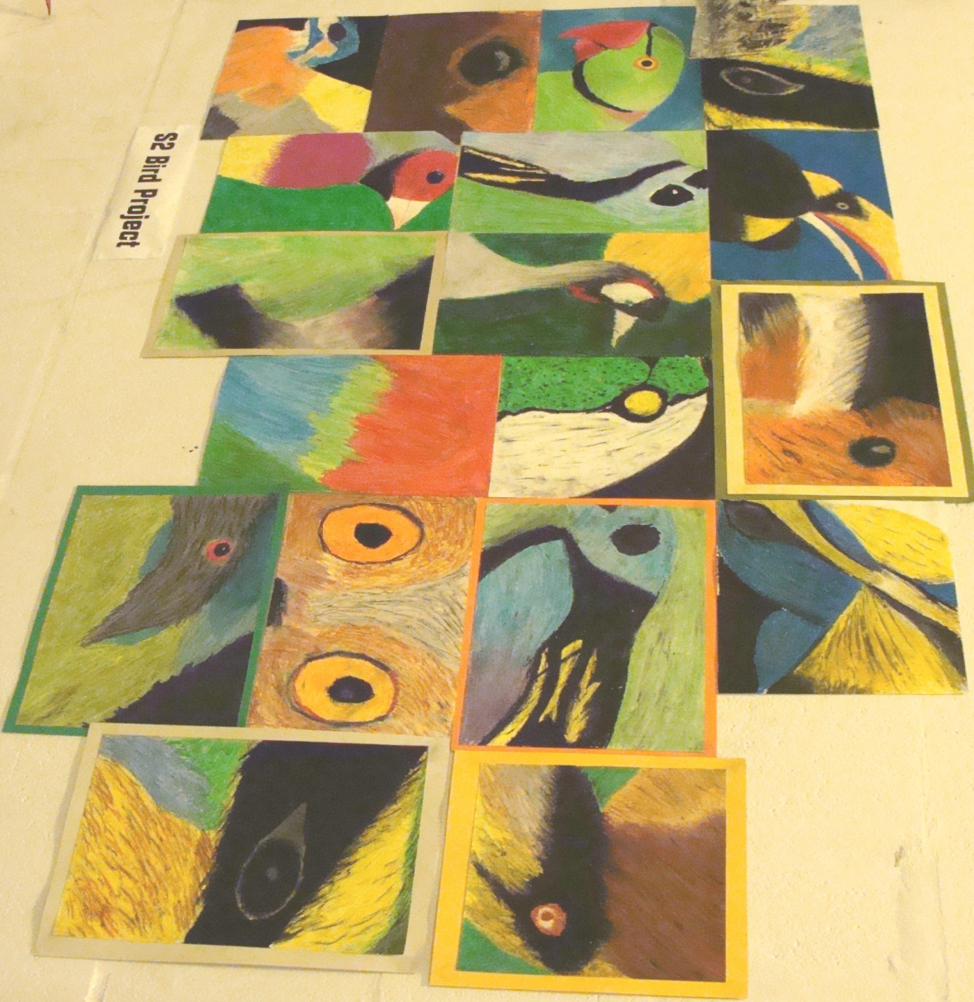
More pictures from the Expressive Arts Showcase