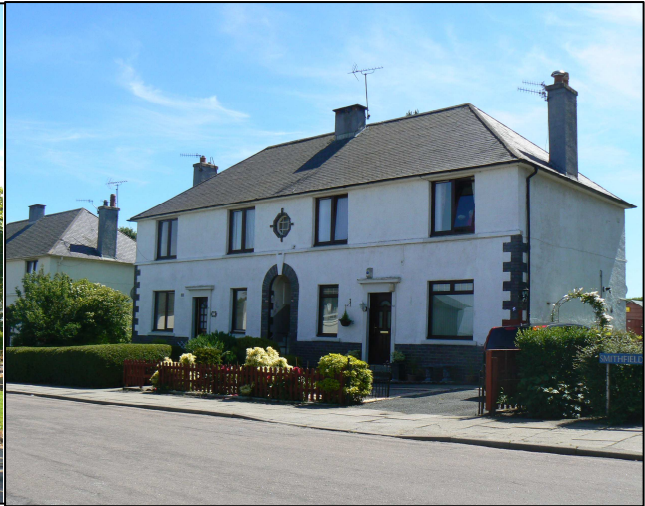
Low rise tenements with private gardens and public open space, wide roads with on street parking. Some housing built around quiet crescents and cul de sacs.