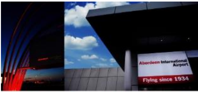
Dyce Academy - Developing the Young Workforce (DYW)